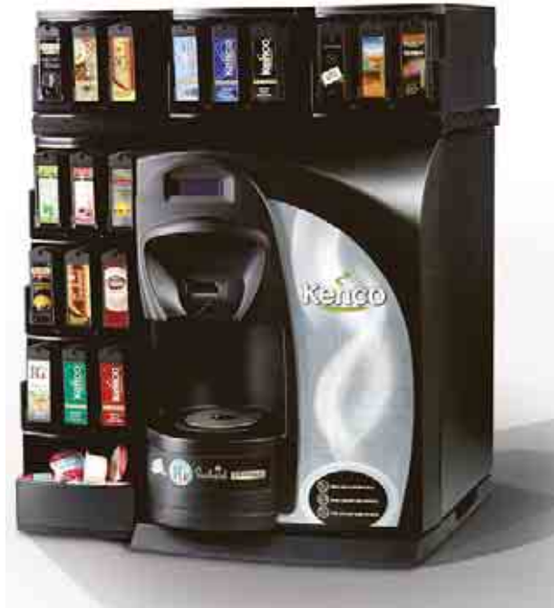
Kenco Singles Brewer

Ideal for: Office reception, boardroom, staff canteen, car show rooms etc