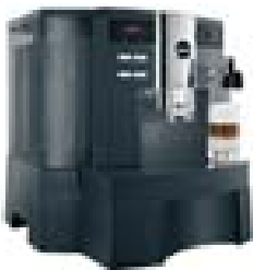
Dimensions 41w x 47h x 39d cm

Setup: This machine requires no plumbing, wiring, waste, regular outside servicing or training the machine is self maintaining with cleaning & decalcifying cycles performed by yourself with tablets, the machine will tell you when these need to be carried out.