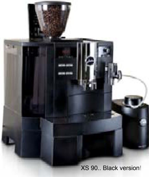
XS 90.. Black version!

This is the revolutionary one touch cappuccino coffee machine. This model will introduce milk to the cup at the same time as the coffee. No moving the cup around, no spilling, no inconsistent product just perfect coffee every time.