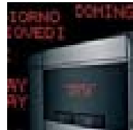
Switches on or off at pre set times