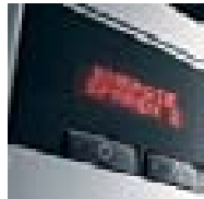
Energy Save mode