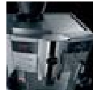
Large 1kg Grinder

Setup: This machine requires no plumbing, wiring, waste, regular outside servicing or training the machine is self maintaining with cleaning & decalcifying cycles performed by yourself with tablets, the machine will tell you when these need to be carried out.