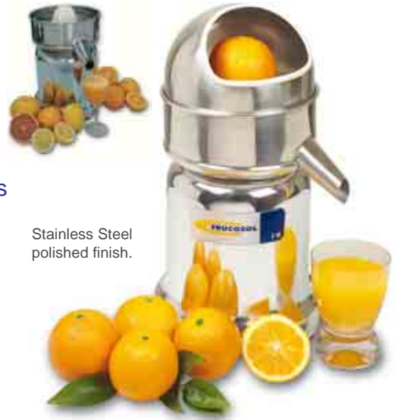
Stainless Steel polished finish.