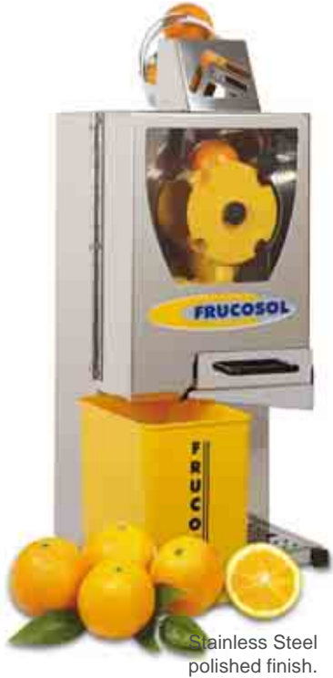
Stainless Steel polished finish.